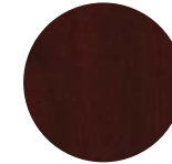
WC31431-03 Harvest Cherry NEW COLOR!