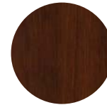
PR67666 Sweet Cherry

Backed by the Bush Furniture 6-year Manufacturer's Warranty.