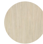
KI30126-03 Driftwood Dreams

Backed by the Bush 3-year Manufacturer's Warranty.